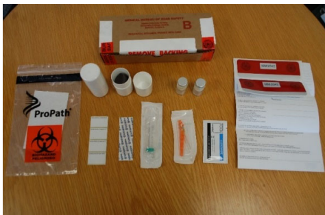
Kit with BD Eclipse needle