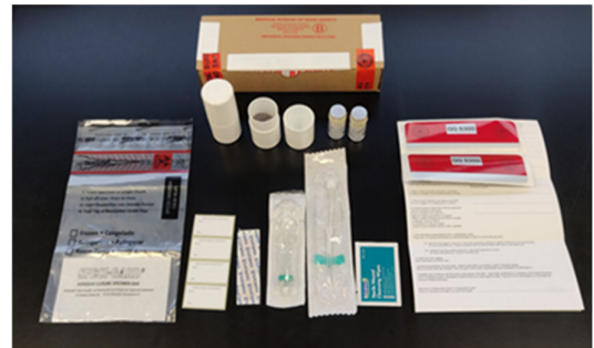
Kit with Safety-Multifly R needle

After Section 15(2) has been complied with, the following additional steps must be followed for Health and Safety Requirements before forwarding specimen(s) to the Medical Bureau of Road Safety: